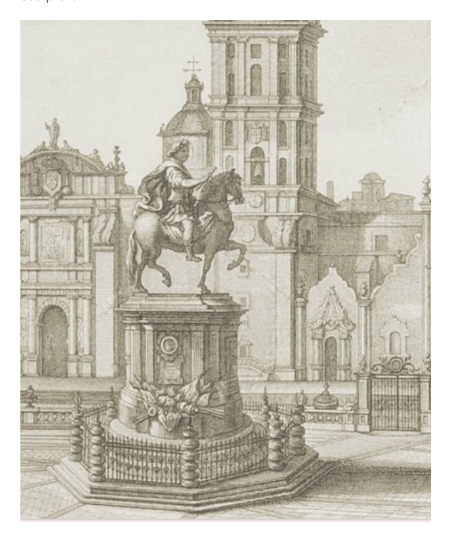
FIGURE 5. Detail of the view of the Plaza de México Newly Adorned for the Equestrian Statue of Our August Reigning Monarch Charles IV by Fabregat y, Ximeno y Planes. The downed eagle is not seen, although neither is the quiver. (Authors: Rafael Ximeno y Planes; engraver: José Joaquín Fabregat, 1797; source: Google Arts and Culture; courtesy: Museo Soumaya, Carlos Slim Foundation).

It has been presumed that the downed eagle must have been present in the temporary wooden sculpture, but not in the metallic one; however, most of the representations of the sculpture at the Plaza Mayor—engravings and paintings—correspond to the wooden sculpture, and none of them depict an eagle (Figures 5 and 6), nor does it appear in Tolsá's original designs or models, unlike the quiver, which does and which we can still be seen today in the sculpture.