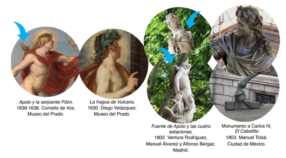
FIGURE 11. Elements for the representation of Apollo: the hair arrangement, the laurel crown, and the quiver, indicated with the blue arrow. Left. Details of two recognized Baroque paintings (Source: Museo del Prado, P001861 and P001171). Center. Details of the Fountain of Apollo or the Four seasons (Photograph: Jannen Contreras, 2022). Right. Details of El Caballito (Photograph: Francisco Kochen, taken from INAH, 2017).

Figure 12 shows sculptural gorgons in a classical Roman work and two neoclassical works, including, of course, the one shown on El Caballito .