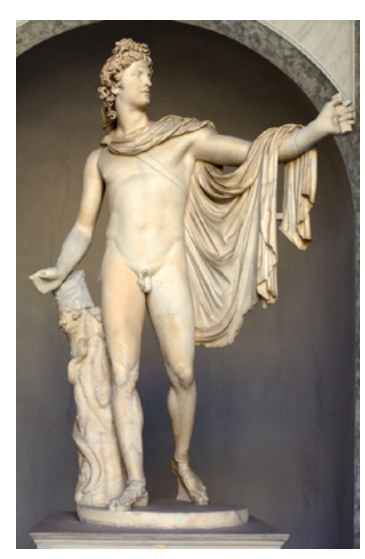
FIGURE 10. Left, Apollo Belvedere, 360 and 320 BC (Photo: Livioandronico, 2013, source: wikimedia). Right, Perseus Triumphant, 1801 (Source: Labyrinths of Art, 2018).