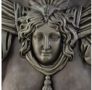
Monumento a Carlos IV, El Caballito . 1803. Manuel Tolsá. Ciudad de México.

FIGURE 12. Faces of gorgons. Left. On the chest of the armour of the emperor Antoninus Pius. Centre. On the Fountain of Apollo and the four seasons. Right. On the chest of the Caballito.