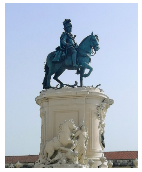
FIGURE 3. Left. Design for the equestrian statue of José I by Joaquim Machado de Castro (Sorce: Descripção analytica da execução da estatua equestre erigida em Lisboa `a glória do Senhor Rei Fidelissimo D. José I, 1810). Right. The sculpture in the Commerce Square, Lisbon (Photograph: Jannen Contreras, 2022).

FIGURE 4. Design of the equestrian statue and monument to Carlos IV, projected for the main square of Mexico, sent to the king for his approval. In the original project the lateral ornaments were to bear portraits of the royal family, but instead the king approved the placement of representations of the four parts of the world (Source: Archivo General de Indias, Sevilla. ES.41091. AGI//MP-ESTAMPAS, 34).