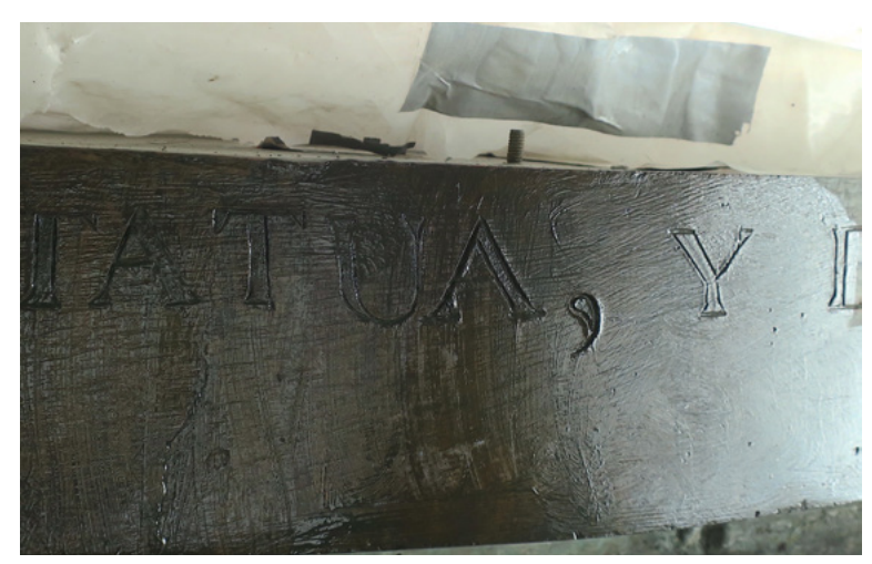
FIGURE 7. Location and detail of the screw at the front of the bronze base during the cleaning process. (Photograph: Francisco Kochen, taken from INAH, 2017. Right, Photograph: Jannen Contreras, 2017).