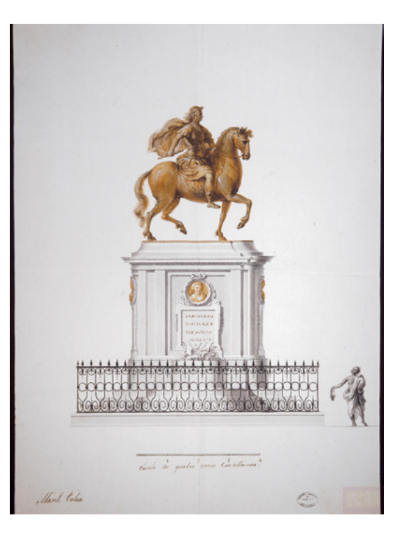
FIGURE 4. Design of the equestrian statue and monument to Carlos IV, projected for the main square of Mexico, sent to the king for his approval. In the original project the lateral ornaments were to bear portraits of the royal family, but instead the king approved the placement of representations of the four parts of the world (Source: Archivo General de Indias, Sevilla. ES.41091. AGI//MP-ESTAMPAS, 34).