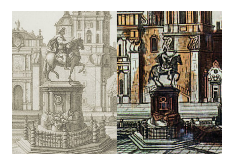
FIGURE 6. Left. Detail of the view of the Plaza Mayor de México. Right. Detail of the view of the Great Place of Mexico ca. 1800. In neither case does the quiver appear, but neither does the eagle: they were non-important elements for the representation of the sculptur.

The reflection of art historian and great connoisseur of Tolsá's work, Eloísa Uribe (Uribe, in INAH, 2017, pp. 206-207) regarding the quiver is that its inclusion is mostly practical since it is used to cover the support spike, and that Tolsá did not allude to the traditional conventions of European artists. Regarding the eagle, she cites Bargellini (1987, p. 213) and points out that those who claim that the quiver was accompanied by an eagle may be confusing the two elements because they both relate to the iconography of America, which reinforces her view that such claims lack the support of any type of document.