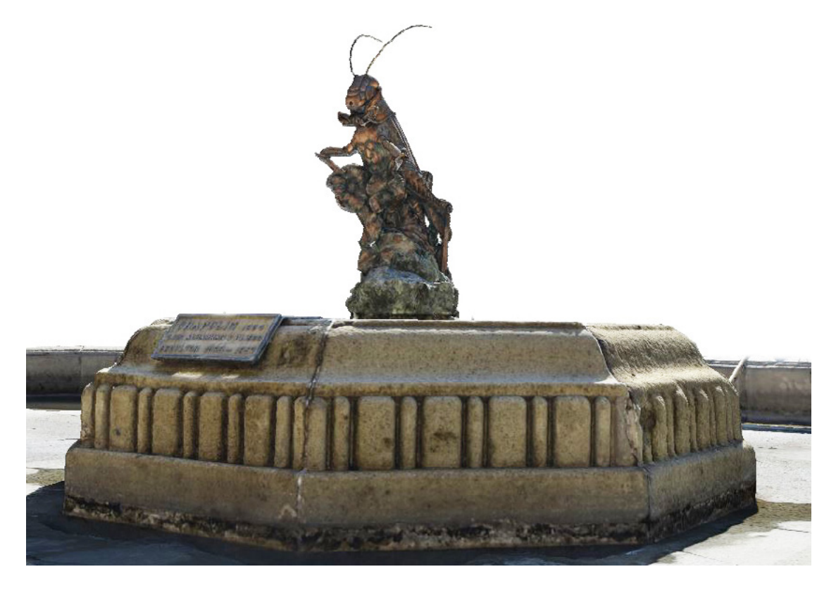
FIGURE 5. Fuente del Chapulín , Alcazar of the MNH. 3D model elaborated by digital photogrammetry (Survey and model elaboration: Emanuel Herrera Dávila, January 16, 2023).