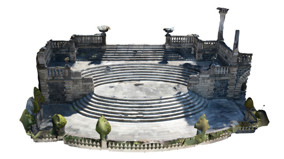
FIGURE 4. Staircase of the Jardín de las Pérgolas, MNH. 3D model elaborated by digital photogrammetry (Survey and elaboration of the model: Áyax Horacio Segura Galván, January 14, 2023; courtesy: Museo Nacional de Historia, CNMH).