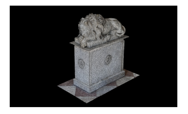
FIGURE 7. Image of the textured mesh in the Escalinata de los Leones , Alcazar of the MNH. 3D model elaborated by digital photogrammetry (Survey and model elaboration: María Sánchez Vega, January 16, 2023).