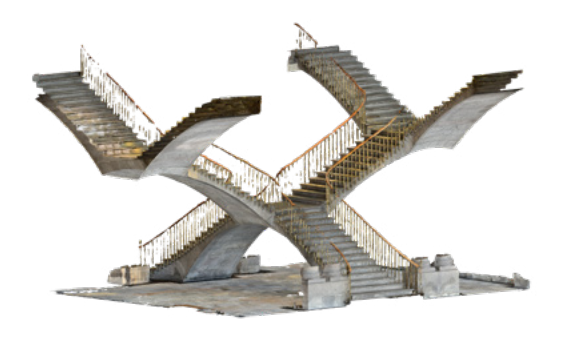
FIGURE 6. Staircase, MNH. 3D model elaborated by digital photogrammetry (Survey and model elaboration: Fabián Bernal Orozco Barrera, January 16, 2023).