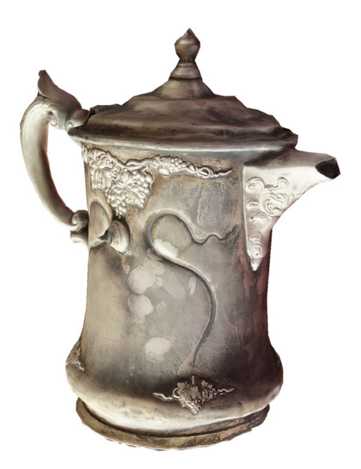
FIGURE 8. Samovar, MNH. 3D model elaborated by digital photogrammetry (Survey and model elaboration: Ángel Mora Flores, January 17, 2023; courtesy: Museo Nacional de Historia, CNMH).

It was also possible to conduct exercises to join interior and exterior 3D models in order to have a fully surveyed property or site. In addition, digital surveys were made using applications or Apps designed for cell phones with an ios operating system merely to explore the LiDAR sensor on iPhone Pro devices. There was a session to export the Agisoft Metashape 2.0 point cloud to AutoCAD using Autodesk ReCap as a means between those two programs in order to draw plans.